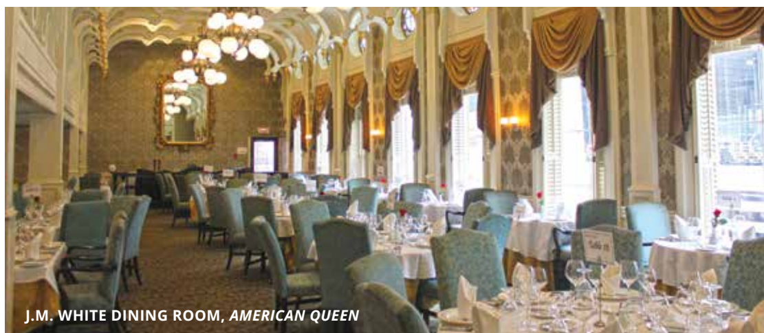
J.M. WHITE DINING ROOM, AMERICAN QUEEN

I nspired by America's heartland, our Southern heritage and the Pacific Northwest, our menus showcase the varied cultural and culinary influences of our nation. Meals aboard any of our elegant riverboats will keep you savoring the memory of the flavors and sharing your excitement for our excellent service even after you leave the boat.